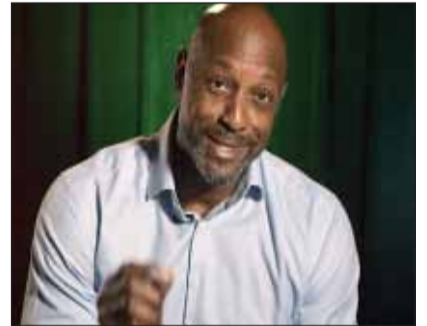
Philanthropist and basketball legend Alonzo Mourning accepted the Sports and Wellness Award, presented by Doctors Hospital and Baptist Health Orthopedic Care.